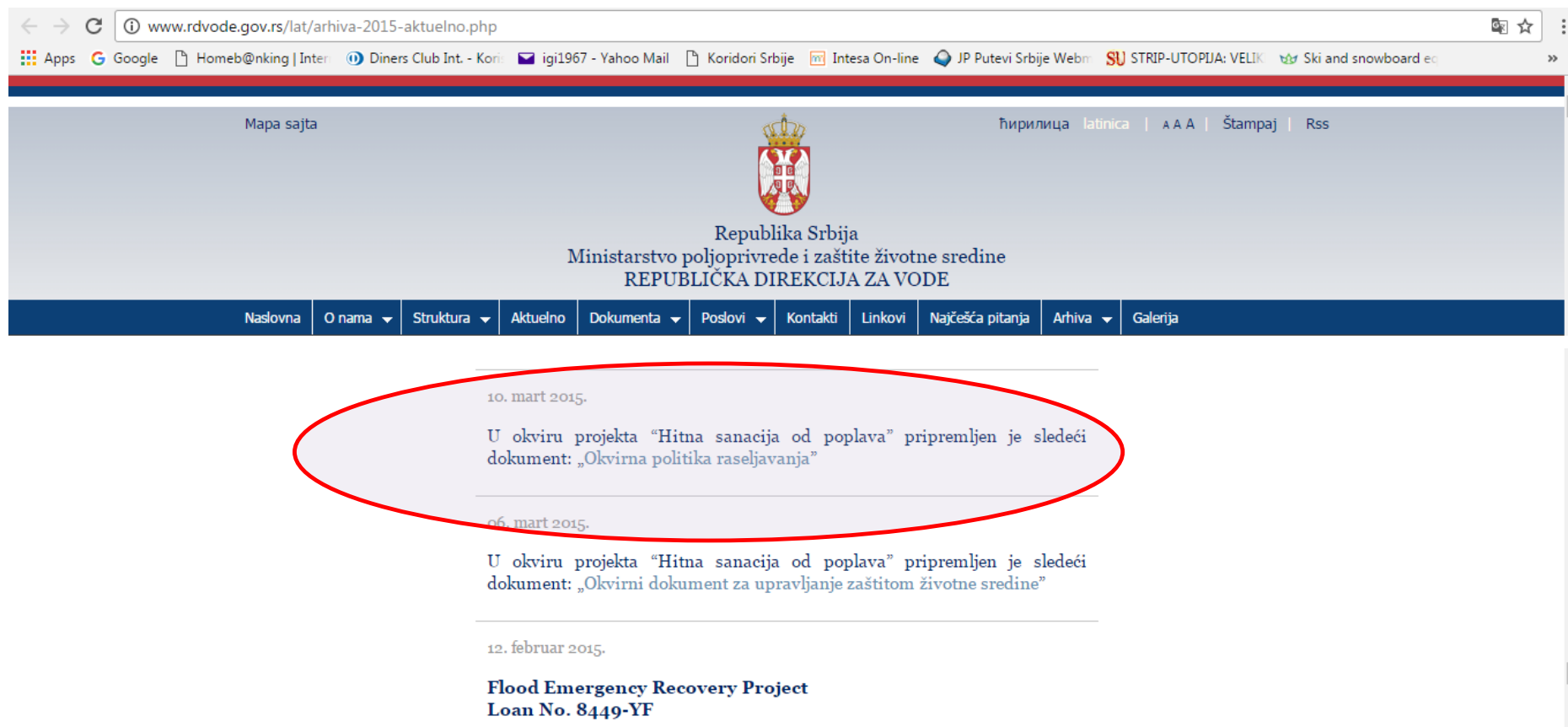
Picture 1: Announcement and public disclosure of DRAFT RPF document on Ministry web site, March 10, 2015